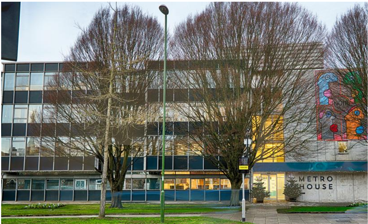
Picture 2.0: Better Risk's new Head Office at Metro House, Chichester, United Kingdom.

The company is now based at the new Head Office at Northgate, Chichester, in the United Kingdom.